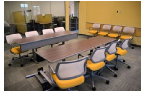
The “fish bowl” is enclosed by two floor-to-ceiling glass walls and two sheetrock walls painted yellow, and furnished with chairs upholstered in yellow fabric.

Walcott Adams Verneuille Architects designed a space that takes advantage of natural light coming through a wall of windows that bounces off light wall colors. Staff members will work from open pods partitioned by glass and attend group meetings in a centrally-located, glass-enclosed area nicknamed the “fish bowl.”