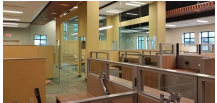
This view of the EastPointe multidisciplinary team office shows the cubicles surround the “fish bowl” meeting space and the wooden accents hanging from the high ceilings.