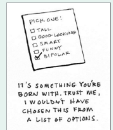
Project 1 in 4 sketches by Marissa Betley