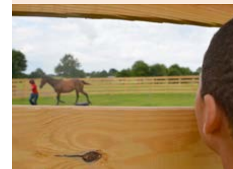
Equine therapy uses the nature and relationship with the horse to bring out a child's natural patterns of relating, handling of new situations, and problem-solving skills.